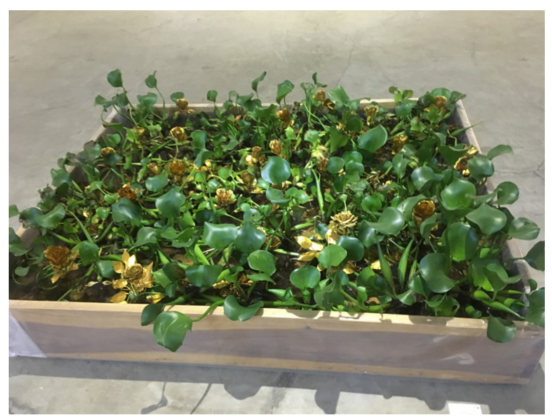
Fig. 1 Siti Adiyati Enceng Gondok Plastic, water hyacinth 1979 Collection of Artist