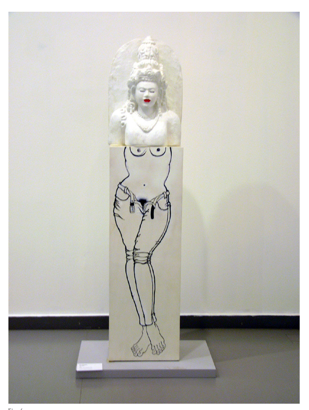
Fig. 4 Ken Dedes Jim Supangkat 1975 remade 1996 Plastic, wood, marker pen and paint 125.5 \times 41.5 \times 26 cm 61 \times 43.5 \times 27 cm Collection of National Gallery Singapore