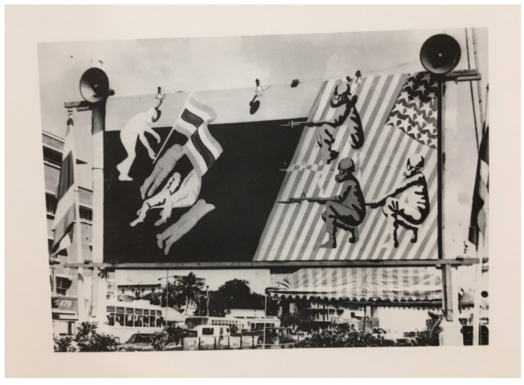
Fig. 5 The Artists' Front, Thailand exhibition of paintings, posters, murals and banners at the Rajadamnern Avenue, Bangkok

Singhasari empire in Java. It was believed that whoever married Ken Dedes would destine to kingship. Ken Dedes' sacred powers defined by her pure beauty and sexuality are given a vulgar reinterpretation by Jim Supangkat. The meaning conveyed by the cartoon-graffiti part of Ken Dedes adopts a system of depiction based on cartoons that juxtaposes with the sculptural head that conveys a different system of representation derived from Hindu-Buddhist iconography. The combination of two different and incongruent systems of representation in one single artwork produces a new mode of representation that provokes the viewer to think critically about the differences ways in which the real was represented across time and cultural contexts.